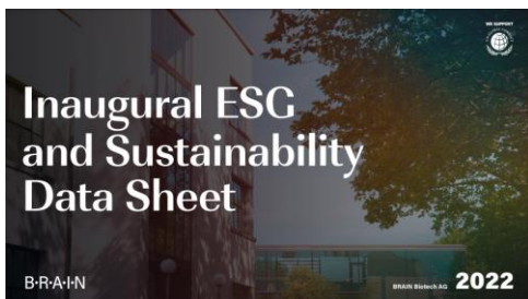
Cover page "ESG and Sustainability Data Sheet"